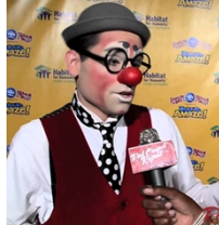
The Dynamic Duo